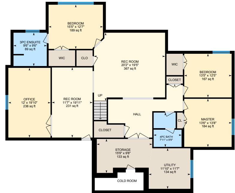
Lower Floor (Below Grade) Exterior Area 2426 sq ft