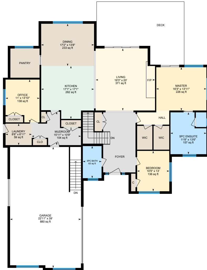
1st Floor Exterior Area 2606 sq ft

Main Building: Total Exterior Area Above Grade 2606 sq ft