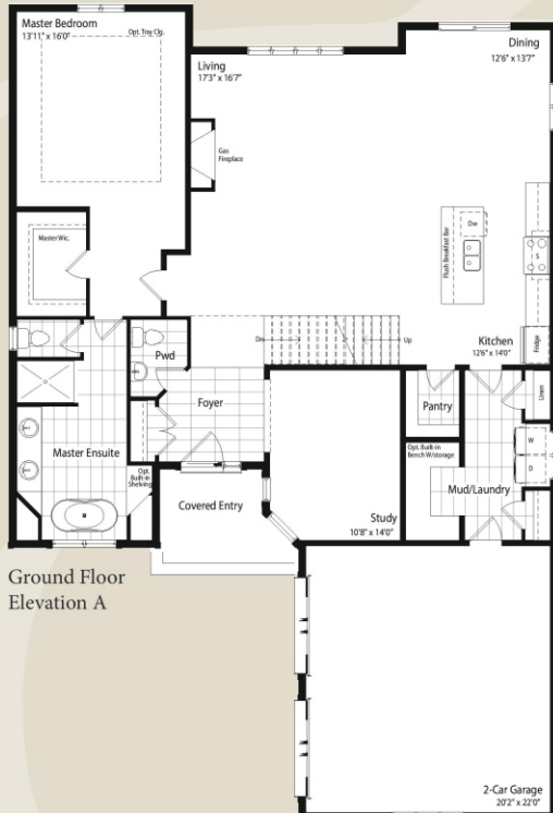
Ground Floor Elevation A