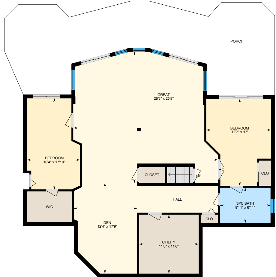
GROUND FLOOR Exterior Area 1711 sq ft