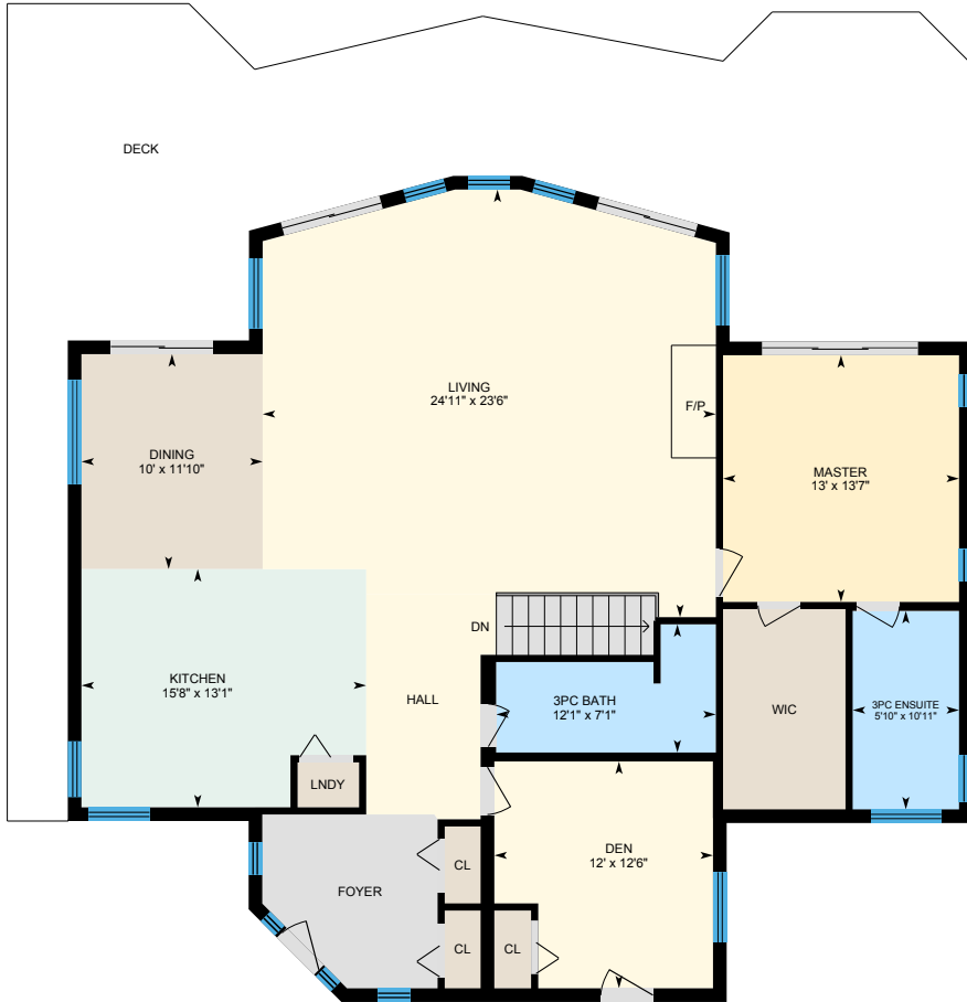
MAIN FLOOR Exterior Area 1771 sq ft

Main Building: Total Exterior Area Above Grade 3482 sq ft