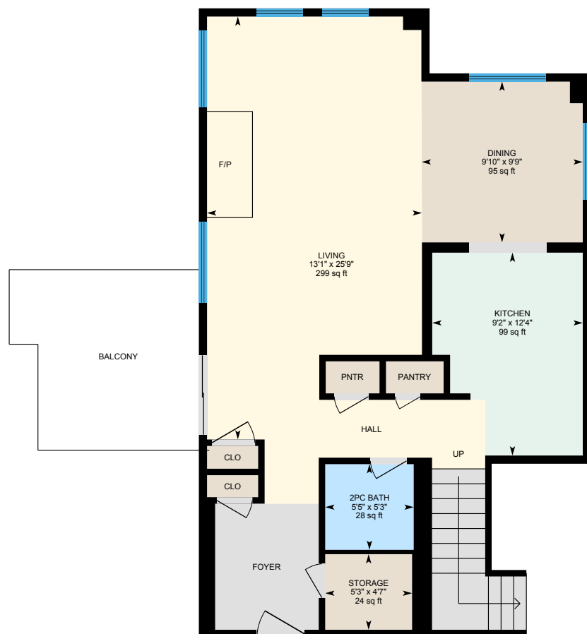
1st Floor Exterior Area 816 sq ft

Main Building: Total Exterior Area Above Grade 1815 sq ft