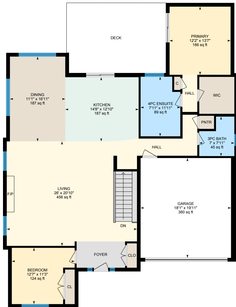
Main Floor Exterior Area 1757.94 sq ft

Main Building: Total Exterior Area Above Grade 1757.94 sq ft