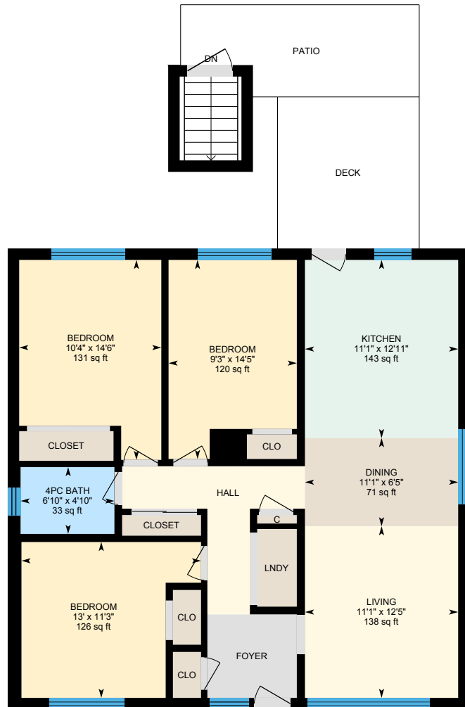
Main Floor Exterior Area 1135.67 sq ft

Main Building: Total Exterior Area Above Grade 1135.67 sq ft