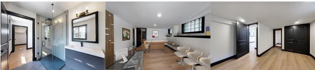
virtual staging used