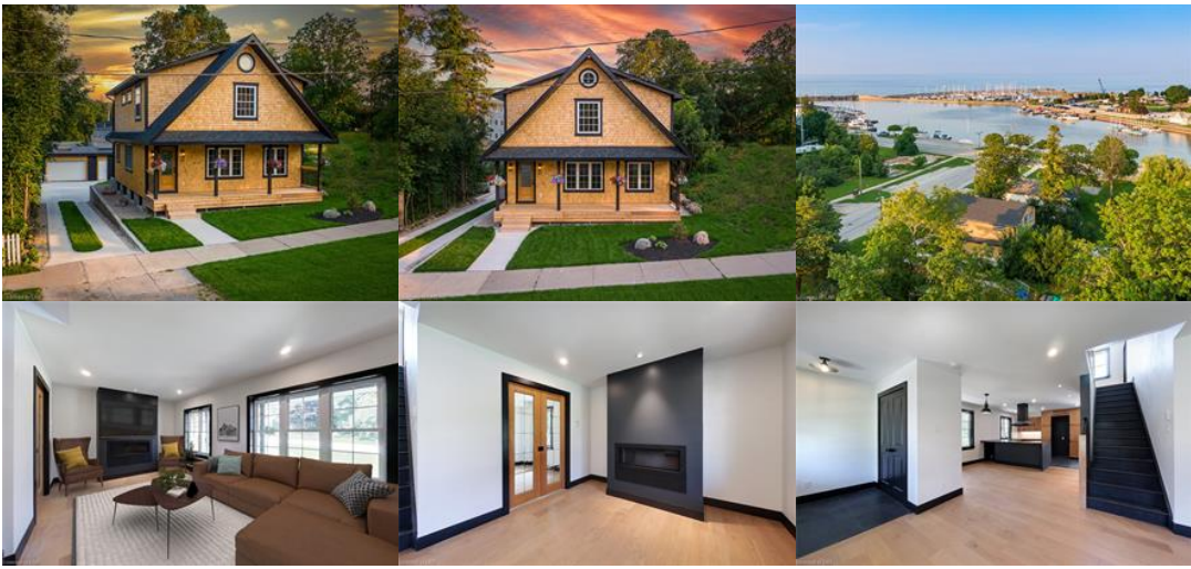
virtual staging used