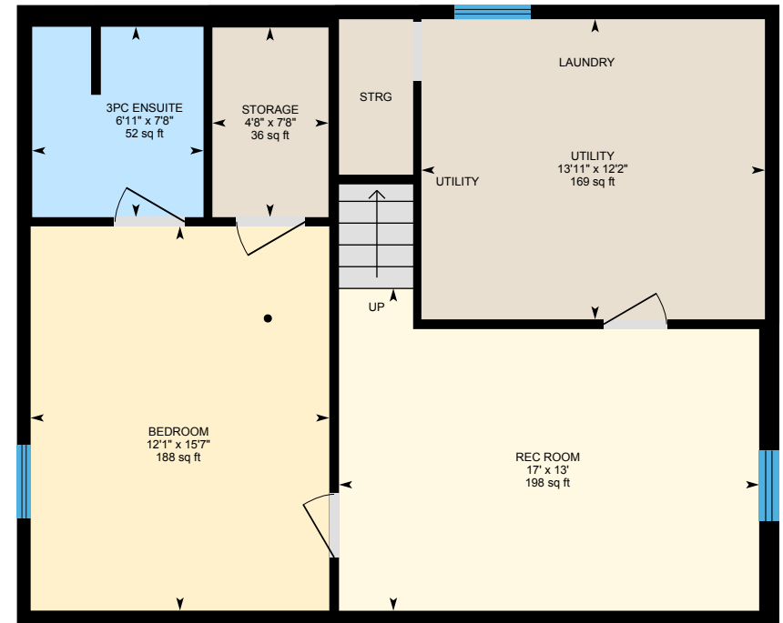
Lower Level (Below Grade) Exterior Area 766.71 sq ft