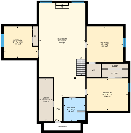
Basement (Below Grade) Exterior Area 1896.89 sq ft