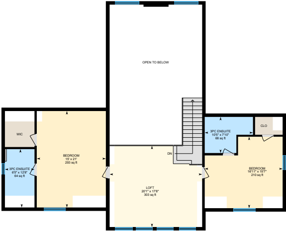
2nd Floor Exterior Area 1283.95 sq ft