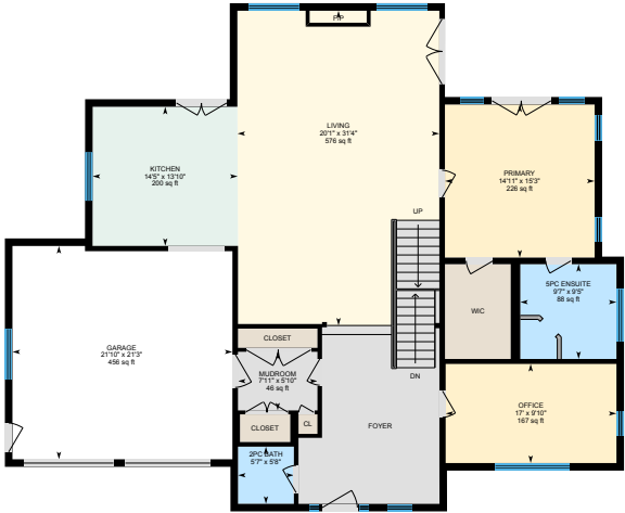
1st Floor Exterior Area 1926.79 sq ft

Main Building: Total Exterior Area Above Grade 3210.74 sq ft