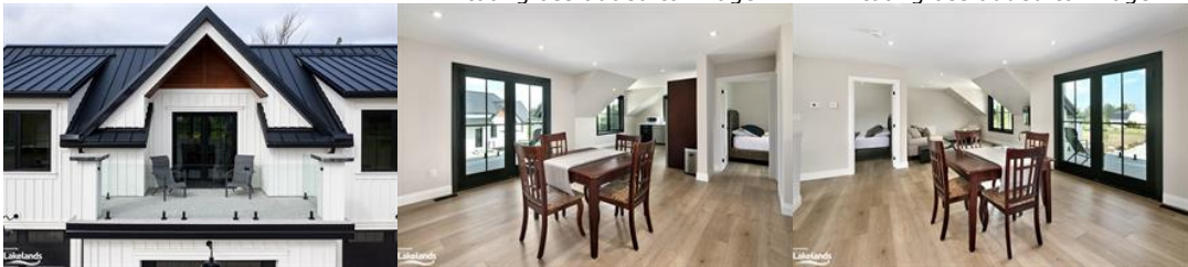
Grass seed has been planted. Virtual grass added to image