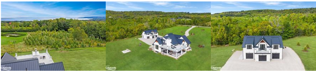
Grass seed has been planted. Virtual grass added to image